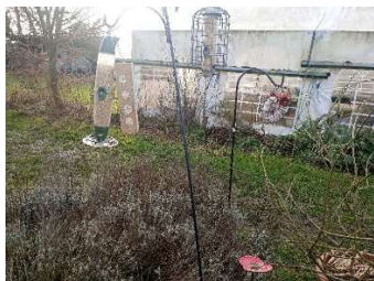
Rainbow garden helping to feed the wild birds. There are many bird visitors, and again Rainbow counted lots of birds for RSPB. We make sure there is cover for small birds because we have lots of hunting birds too! 😬

I often see the tracks and paths that animals make running through. These are easier to see in winter, and sometimes you can see their tracks too!