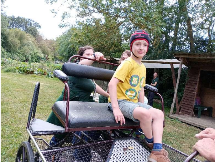
We need a horse to pull this cart!

We had a lovely day this summer when ACCURO came to visit Cameo's driving cart was very popular