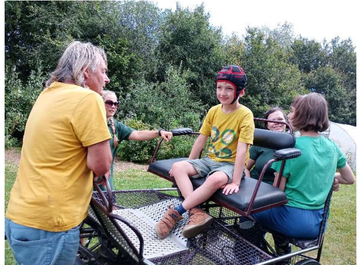
Hey guys..... I have an idea