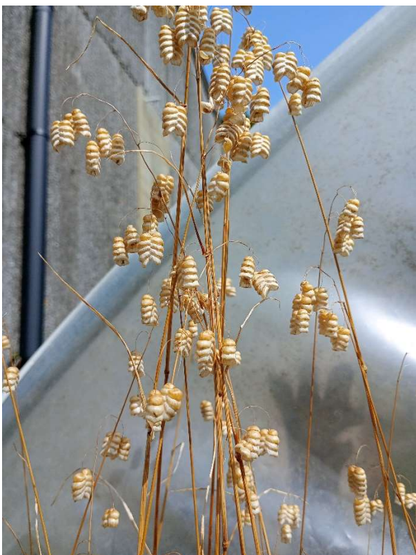
Snakes Head grass seed?

It's a real pleasure for Sally my Lurcher dog, and I to walk our family farm and neighbouring farmer's footpaths. Sally particularly perks up with new sniff's 🐕! I also enjoy walking and looking at their crops and wildlife areas too. This was a small field left for habitat and wildflowers.