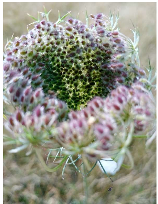
This plant really caught my eye Identification?!!.