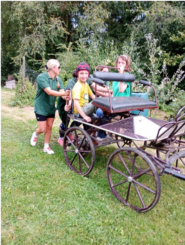
Maybe some pushing will do the trick?